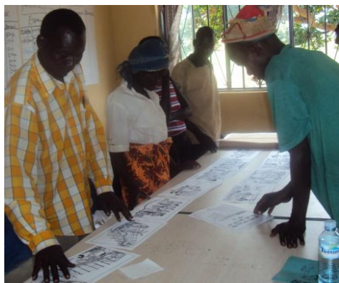
Training of Water user Committees