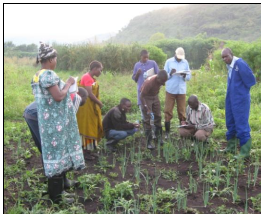
A trainee making a presentation during training.