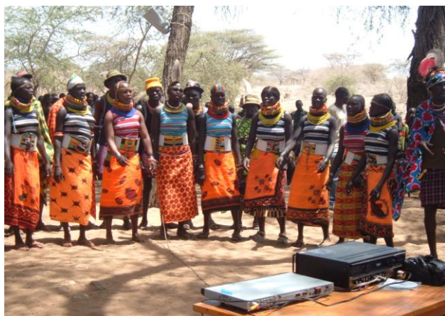
Women singing peace songs during the peace dialogue meeting at Lokiriama peace accord commemoration September 2010.

The project recognizes women and youth as an important target groups for peace building activities and will therefore implement activities promoting peace through creative means, including music, drama, crafts and conflict management courses in schools. Peace monitors among the existing SDCs will be identified to enhance conflict mitigation activities. All activities under this component will have a strong focus on capacity development through trainings, especially on conflict management and peace building, including non-violent communication and mediation while applying the do 'no harm', approach. Every settlement has selected a gender balanced "peace monitors" who will watch and report any incidences. Targeting improvement of security in Karamoja, the GTZ-FNSCMP will also strengthen Conflict Early Warning and Reporting Mechanisms to minimise upcoming conflicts and insecurity.