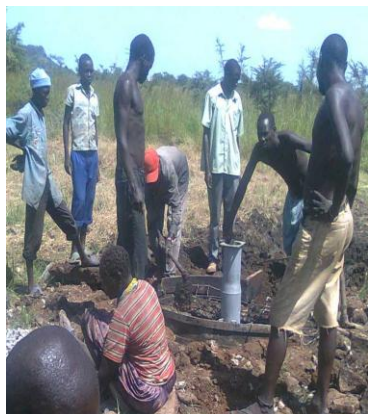
Okudud community repair borehole

Roads: Deterioration of both Feeder roads and village access roads is another impediment to development of business opportunities and improved livelihoods in the settlements. Few traders risk their vehicles on these roads. This drives prices for local goods down, while driving prices for imported goods up. GTZ FNSCMP in July- August 2010 employed a consultant to undertake a study on Nabwal road as means of starting to draw a road map on how to improve the status of the roads within and leading to settlements. This study was conducted for 21km of the road (From Iriiri to Nabwal settlement) and a report with costs for its rehabilitation developed.