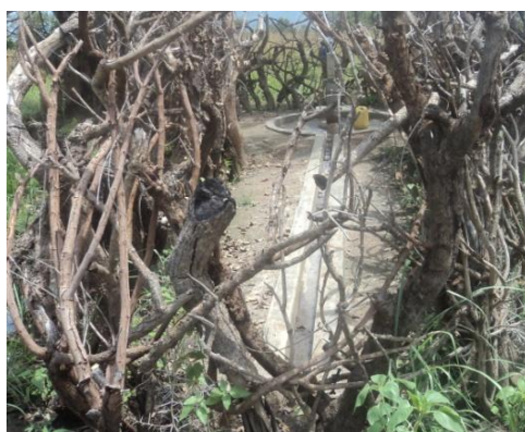
Nabokat borehole fenced and well maintained and a girl child collecting from the source.