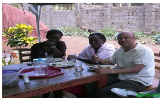
FNSCMP Part of staff having lunch at GTZ office