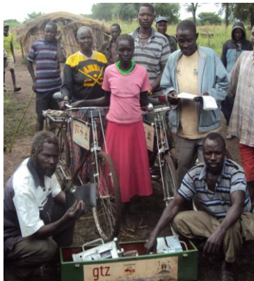
Hand over tool kit to SDC