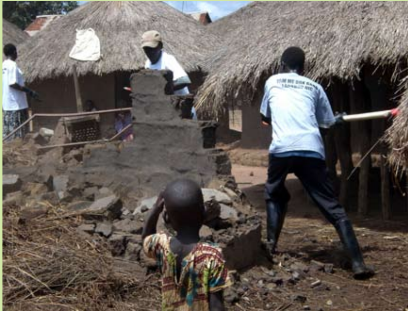
An Acholi man in Lalogi IDP Camp demolishes the family hut in preparation for return.

The PRDP hands primary responsibilities for PRDP implementation to a Coordination and Management Unit (CMU) within the Office of the Prime Minister (OPM). Due to limited funding, however, the CMU has yet to be created and is not expected to be up and running until FY 2009/10. 39 In the absence of a functioning CMU, OPM technical officers have been forced to conduct PRDP activities alongside their existing workloads, slowing down the rate of implementation considerably. The situation in OPM has been further complicated by the GoU's recent decision to appoint two PRDP Commissioners without prior