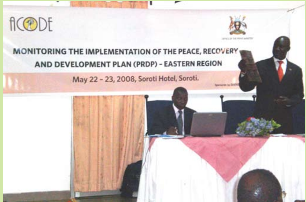
Relief Minister, Hon. Musa Ecweru opens a PRDP workshop in Soroti hosted by ACODE and the Office of the Prime Minister.