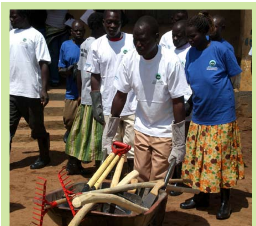
Residents of Lalogi IDP Camp participate in camp clean-up, May 2008.

This report is based on six months of research conducted between May and October 2008. Thirty-five individual interviews were conducted with international donors, government officials and civil society representatives in Kampala, Gulu and Mbale districts. Additionally, observations were made at PRDP-related workshops, humanitarian agency meetings, internally displaced persons' camps and transit sites. 5 Finally, government