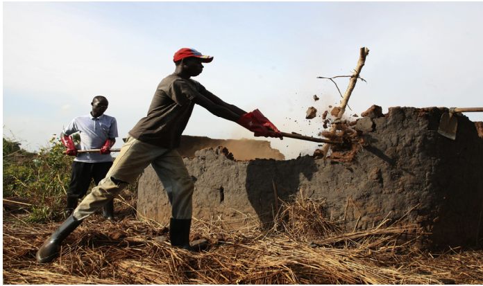
Camp Phase out in Lango

The progress chart operates in two levels: The text in each box expresses the indicators of the clusters and the colors show the trend, toward meeting the target by the end of 2008.